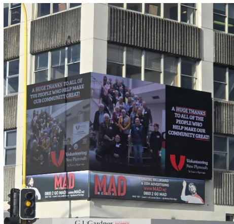
Devon/ Liardet Sts Corner

In June we celebrated our Annual Volunteer Recognition Awards – MAD MEDIA have kindly sponsored two billboards with a photo of the Awardees – have you seen them at New Plymouth New World entrance and on our building the Devon Centre on the corner of Liardet and Devon Streets.