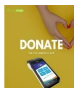
New Tap & Go