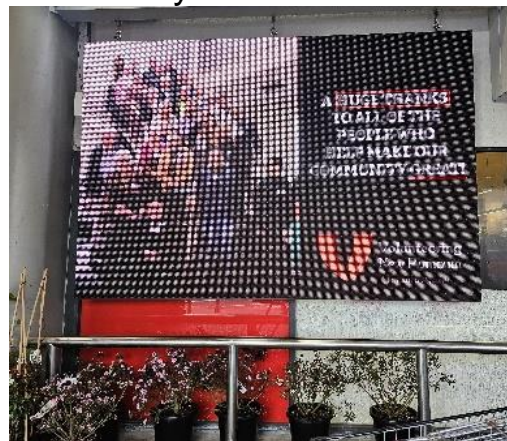
New Plymouth New World